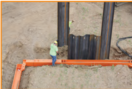
With top level assembled, begin placement of excavation support systems.