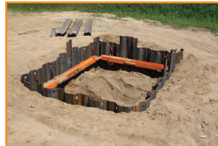
With all supports installed, connect the top level of the MD Brace to the bracing supports with Hanging Chains and pressurize system.