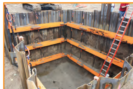
With all rams in place, excavate down to project depth.*