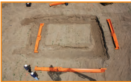
Dig initial pilot cut (2-3') and stage one leg of the MD Brace Hydraulic Rams. If using multiple levels of rams, they may be stacked upon each other to speed up installation time.*

These steps are a guideline. Every project is going to differ from the last and may require a different way to install.