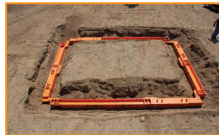
Assemble initial ram and extensions. If using multiple levels of rams, assemble the rams and extensions and stack on top.*