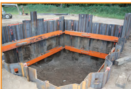
If using multiple levels, excavate to next ram spacing and pressurize system.* Repeat until all rings are installed and pressurized.